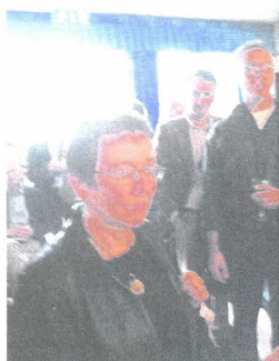
Grianghraif ó Sheimineár 2010/ Photos from the 2010 Seminar: