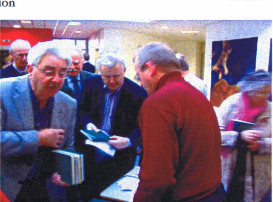
ITS bookstall at 7th ITS/UCC Seminar, UCC, November

will benefit from a discount and pay €12, £9 stg. or US$15 in view of the lesser administration costs on subscriptions paid in this way. If, like many other members, you wish to take advantage of this discount, please let the Honorary Treasurer know, so that he can send you the necessary form to enable you to adopt this method of payment.